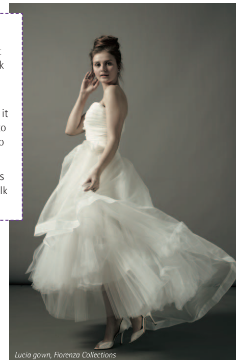
Lucia gown, Fiorenza Collections