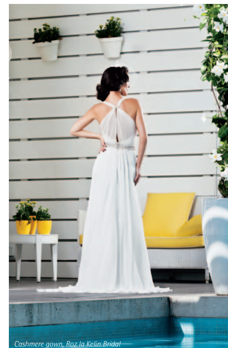
Cashmere gown, Roz Ja Kelin Bridal